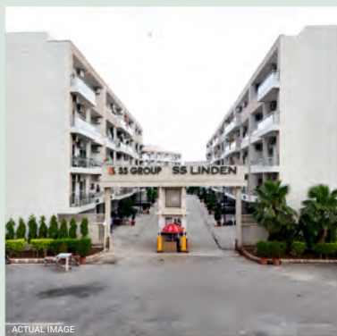
SS LINDEN, SECTOR 84 - 85, NEW GURUGRAM