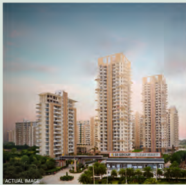
THE LEAF, SECTOR-85, NEW GURUGRAM