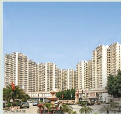
THE CORALWOOD, SECTOR-84, NEW GURUGRAM