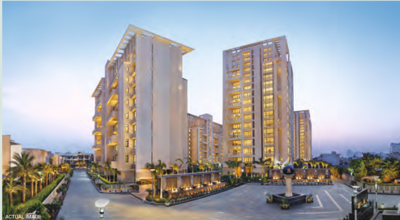
THE HIBISCUS, SECTOR-50, GURUGRAM