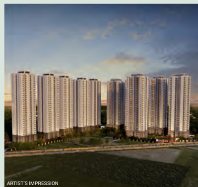
SS CENDANA, SECTOR - 83, NEW GURUGRAM

Delivered over 22 Landmark Residential & commercial projects