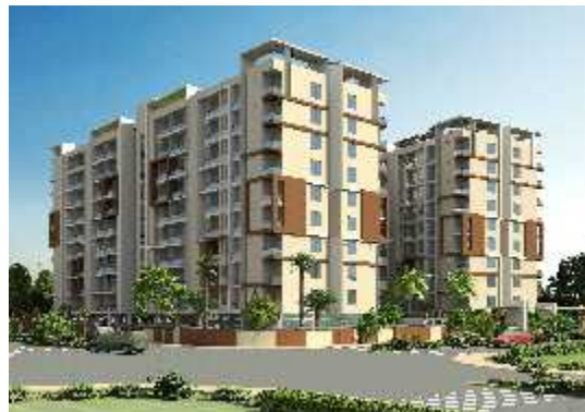
Arihant Legacy | Bilwa, Nr. Chokhi Dhani | Tonk Road