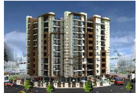
Arihant Shree Krishnam Residency | Opp. Dher ke Balaji Mandir | Ambabari