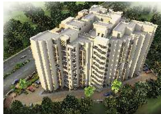
Arihant Sai Residency | Jaisinghpura | Ajmer Road