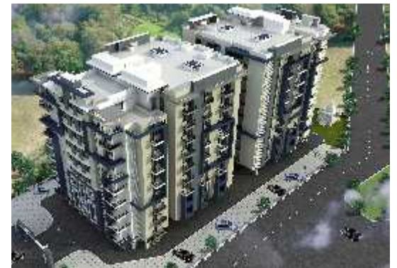
Arihant Shree Krishnam Heights | Nr. Chokhi Dhani | Tonk Road