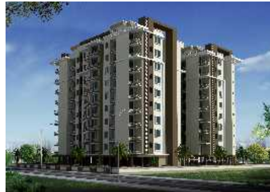
Coral Arihant Heights | Patrakar Colony | Mansarovar