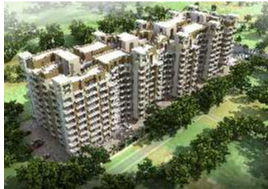
Arihant Dynasty | Patrakar Colony | Mansarovar